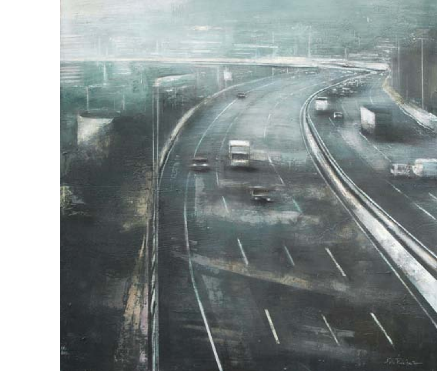
17. The Journey Begins