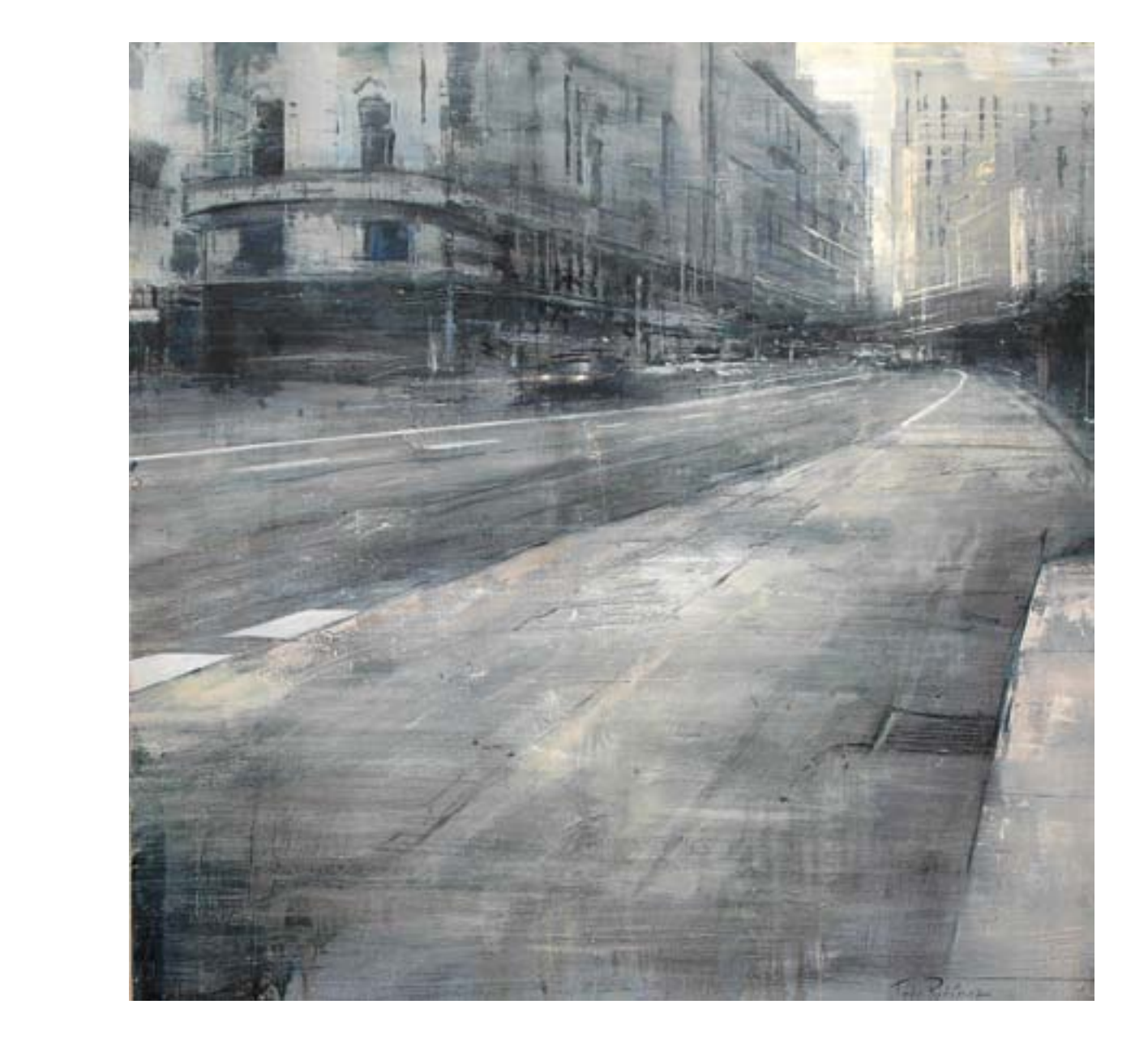
3. High Street